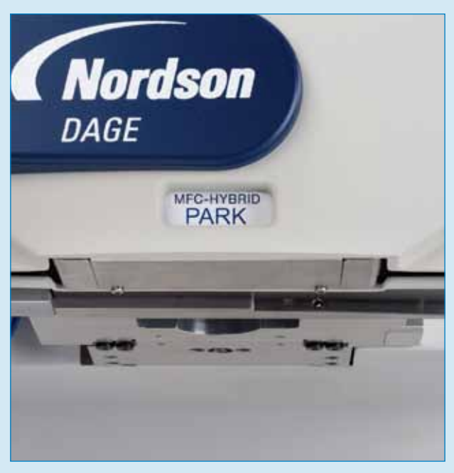
Cartridge window displays the active transducer or indicates that it is in 'Park Position'